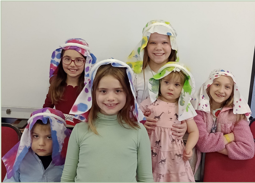
Making shepherd's head-dresses

In Sunday school we have been looking at shepherd stories in the Bible. We started with learning about Cain and Abel, and how Abel showed he was a true follower of God. He gave God the very best of his flock, whereas Cain's vegetables were only second best (and we saw how that affected what happened next!). We looked at Jacob and his spotted sheep, Psalm 23 – The Lord is my shepherd, and the shepherd-boy David being chosen by God to be king, because of his good heart, not because he looked kingly. Then we looked at how Jesus called Himself "The Good Shepherd" and what that meant, and how Jesus often used shepherds and sheep in His teaching.