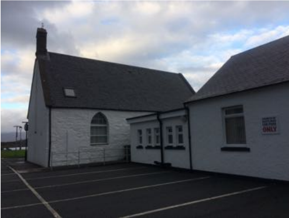
From south west