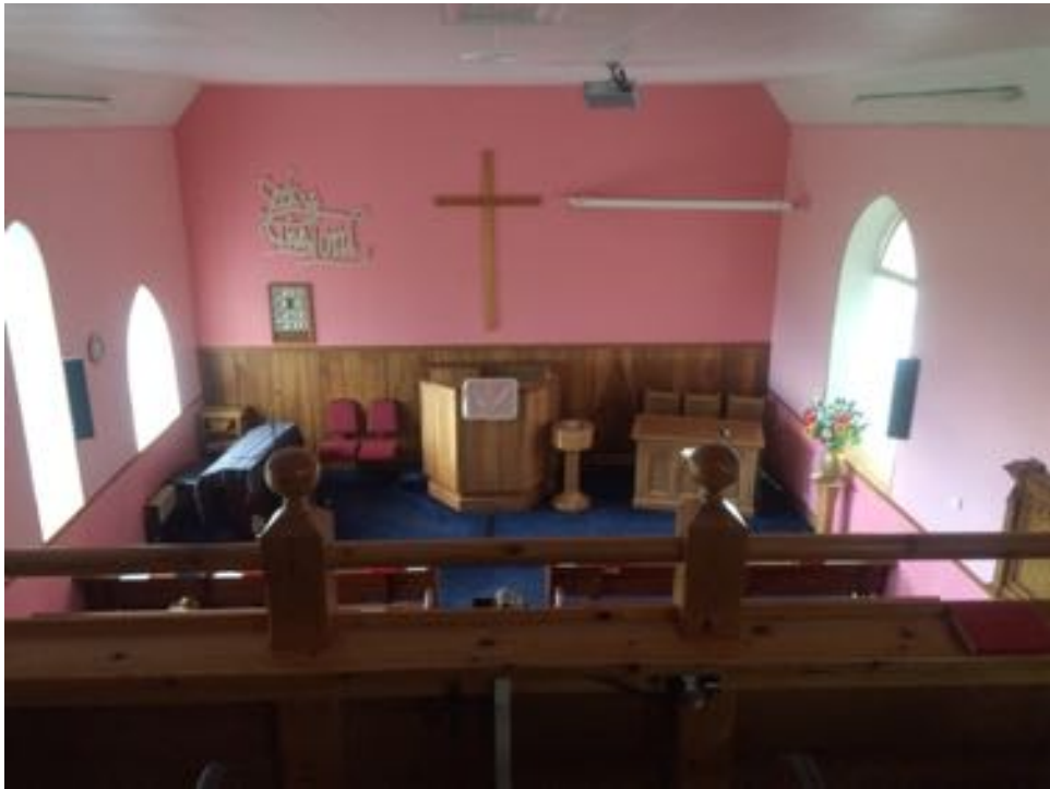
Church interior looking east