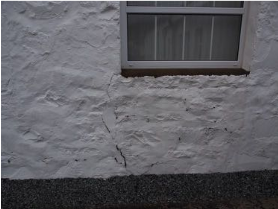
Crack under window west end of south side of church