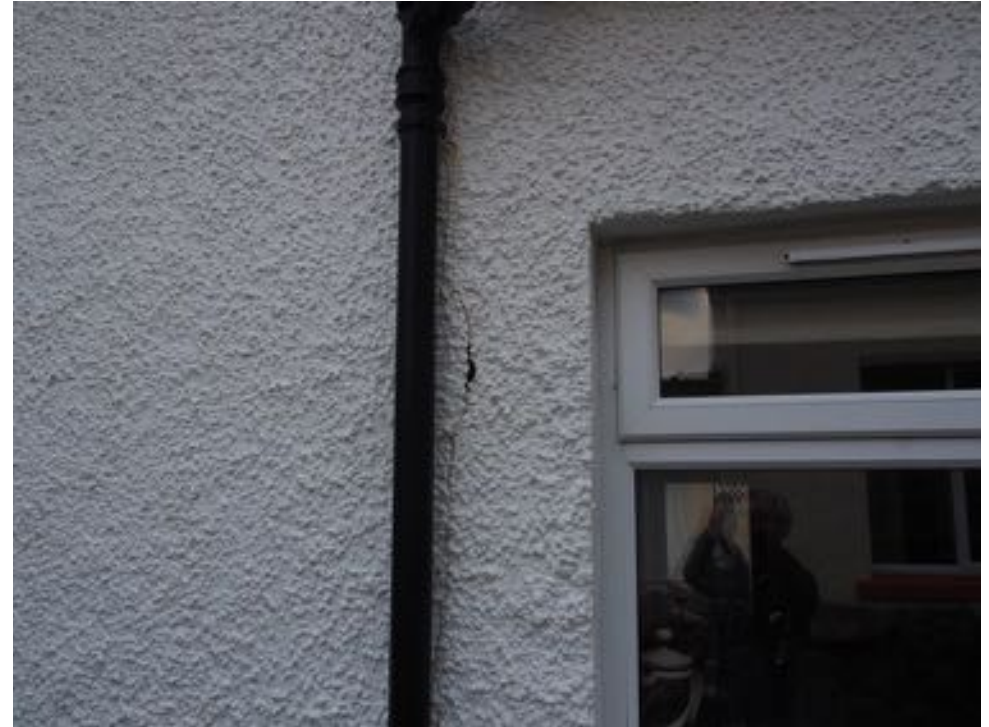
Crack behind downpipes on east elevation