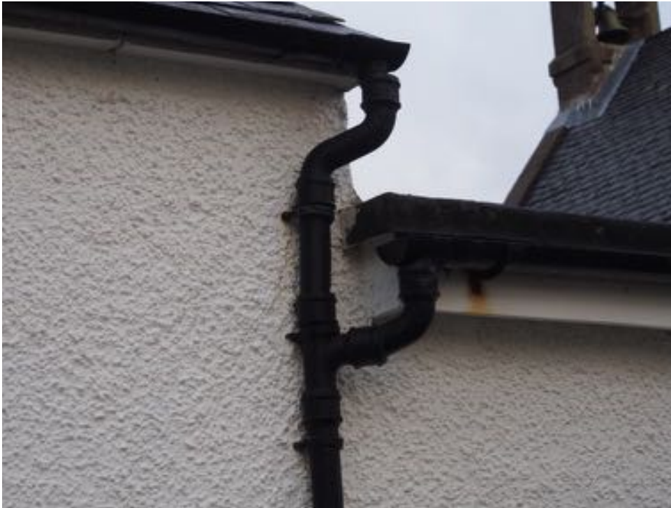
Loose downpipe on east side of extension