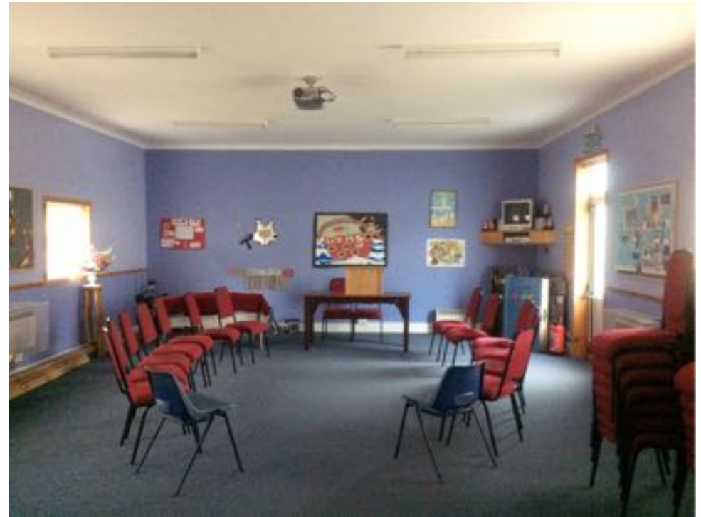
Meeting room interior looking south