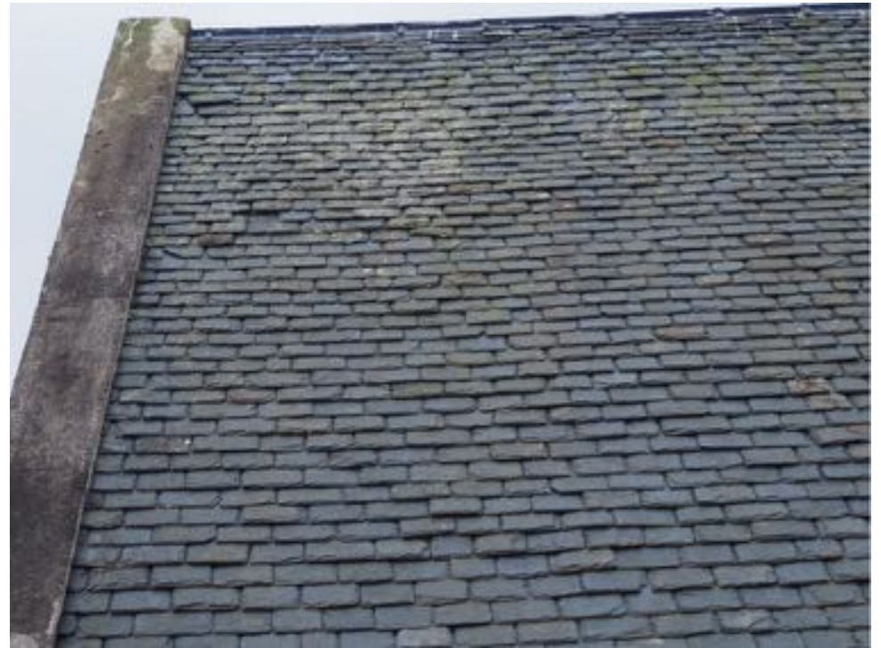
Slate roof at north east side of church