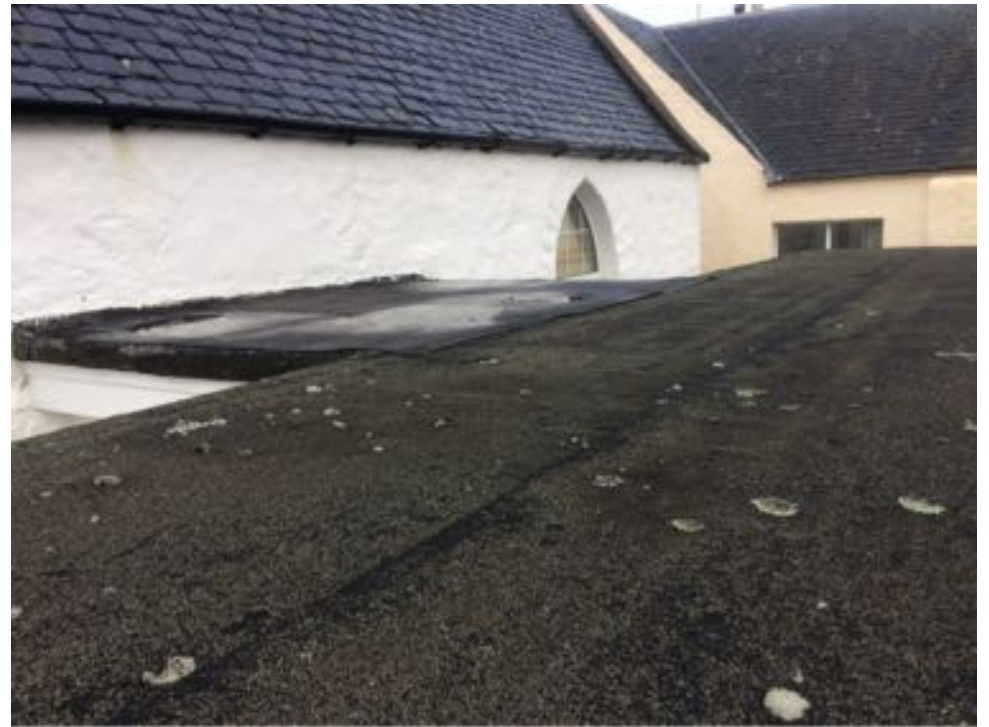
Flat roof of link block