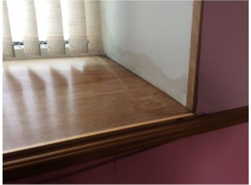
Damp ingress at window reveal south side of church