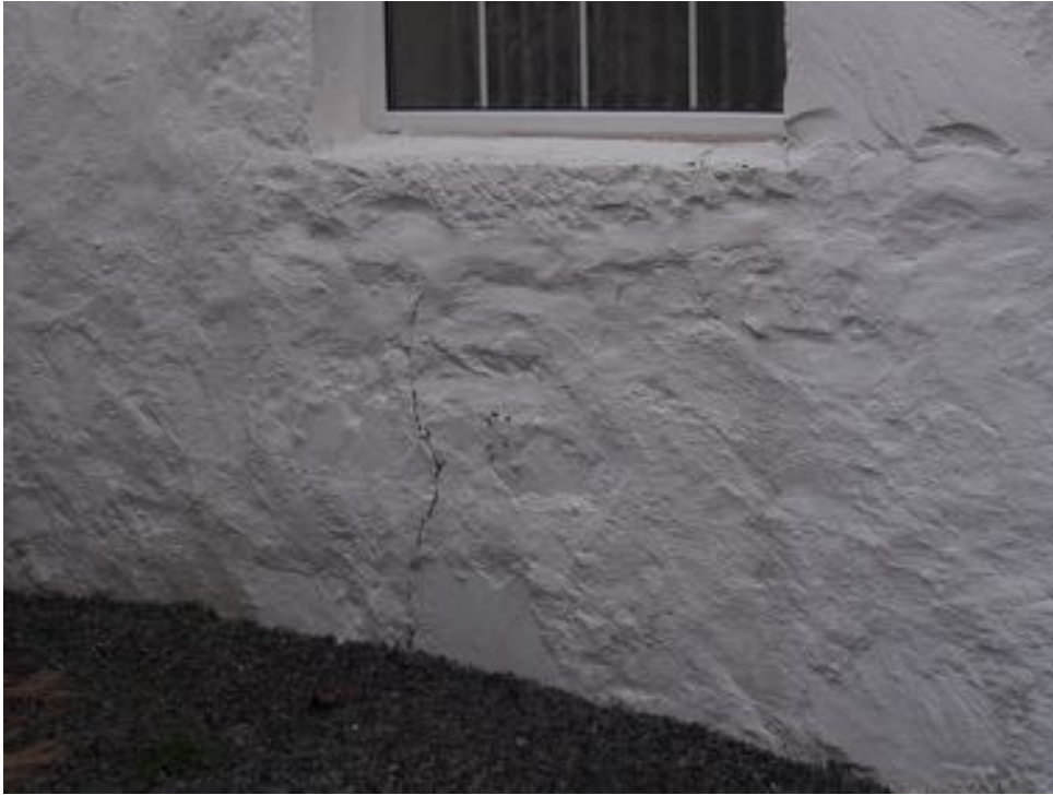
Crack under window east end of south side of church