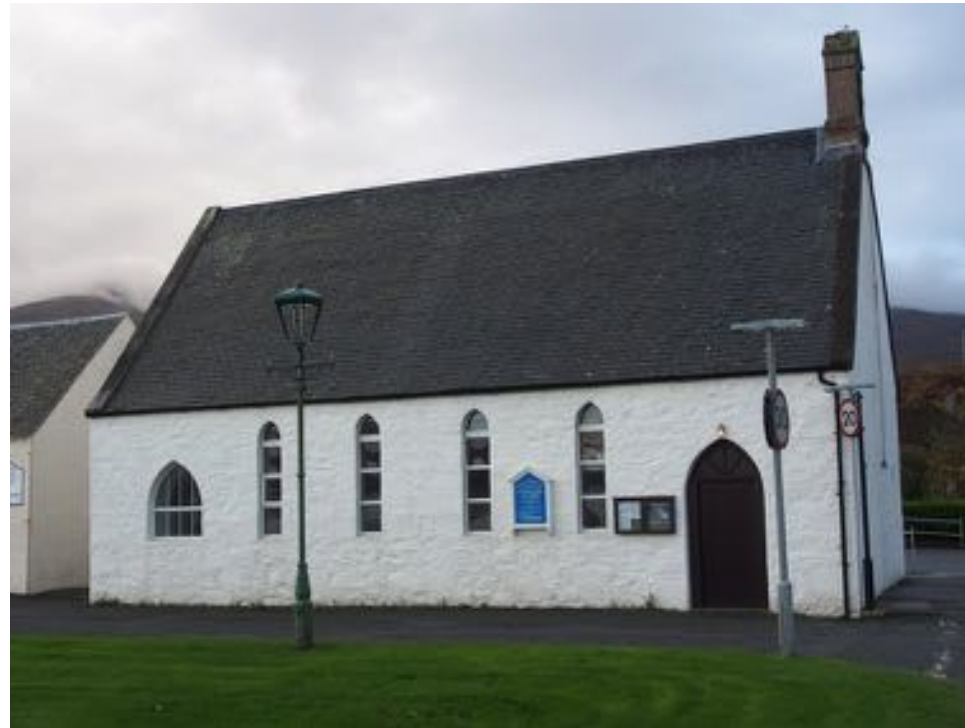
Church of Scotland Lochcarron and Skye Presbytery October 2016