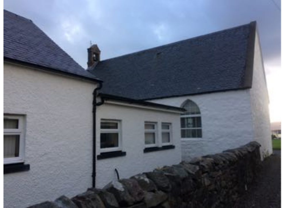
From south east