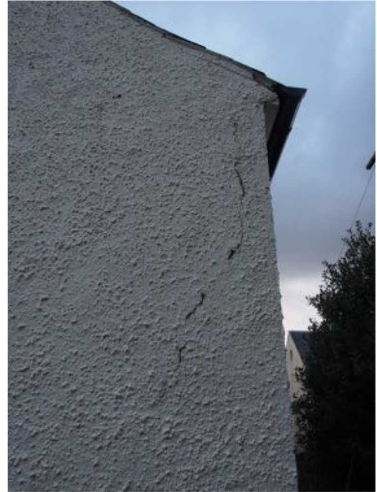
Cracks at south side of hall