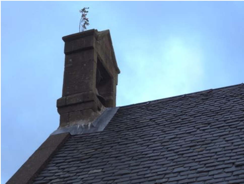
Bellcote with plant growth