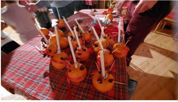
BROADFORD: Christingle Party