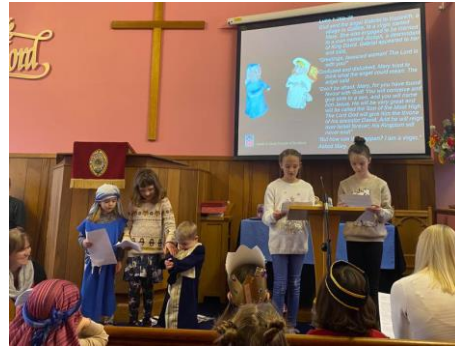
KYLEAKIN: Christmas Family service