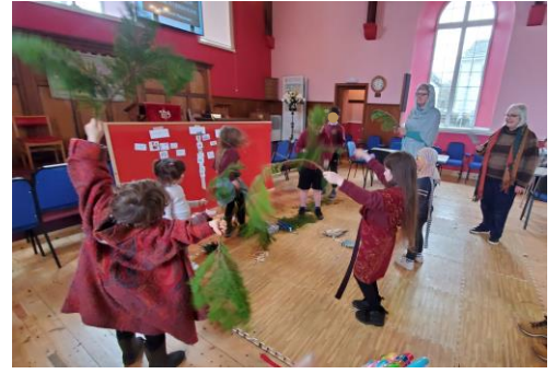
Palm Sunday Mystery Party